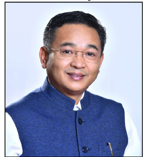
Prem Singh Tamang Chief Minister of Sikkim

The first phase of Sikkim's developmental journey was centred on